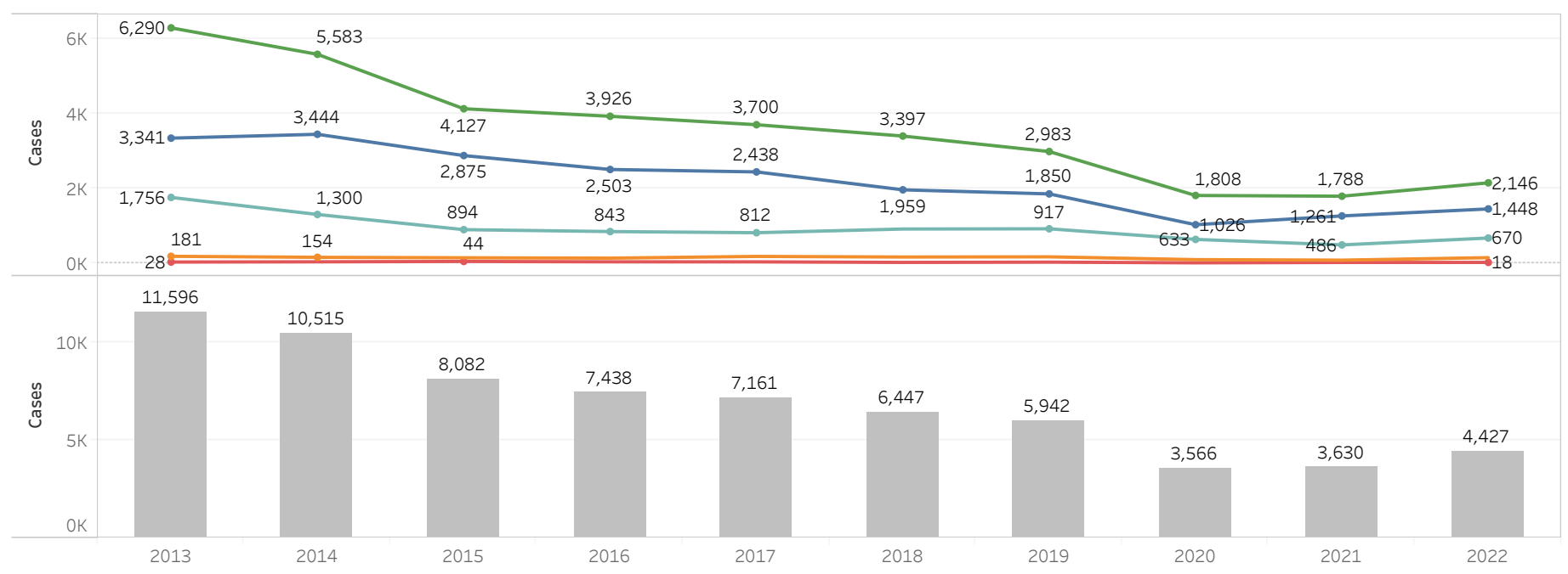
Table 1: Delinquency Cases Disposed per CY by Juvenile's Race/Ethnicity

Figure 1: Delinquency Cases Disposed per CY by Juvenile's Race/Ethnicity